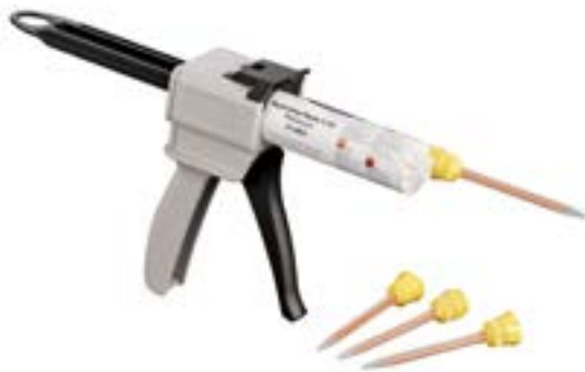
Figure 1.1 Two part silicone replication media and dispensing gun

Replicating media is used for non-destructive investigation of engineering components and materials. The media is a two-part system that solidifies upon contact and reproduces the details of the surface on which it is applied with very high precision. The media finds application in metallurgical/materialographic inspections, failure and forensic investigations and metrology among others.