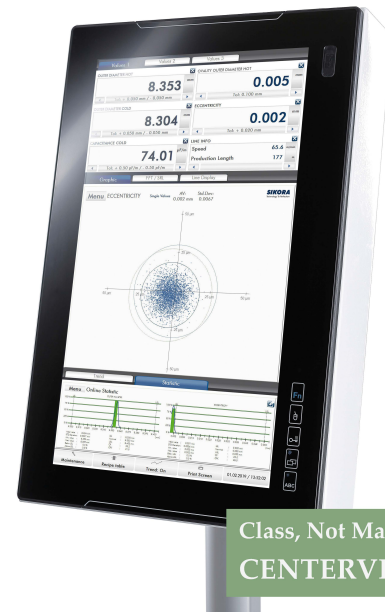
Class, Not Mass with the CENTERVIEW 8000