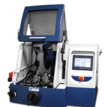
AbrasiMatic® 300 Abrasive Cutter