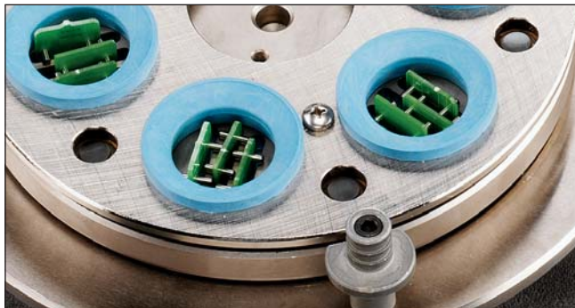
Coupons positioned in the PWB Met Small Hole Accessory.

60-5175 PWB Met Small Hole Accessory , includes a precision holder with 6 cavities, each capable of holding up to 3 printed wiring board coupons, top mold plate and magnetic mold base for accurate board encapsulation, 6 polycrystalline diamond stops (60-5173), lever actuated pin loader, drive for lift-lock chuck (1950S152), silicone mold release spray (20-3406), 3000 indexing pins, dial indicator calibration gauge, gauge blocks and operating instructions.