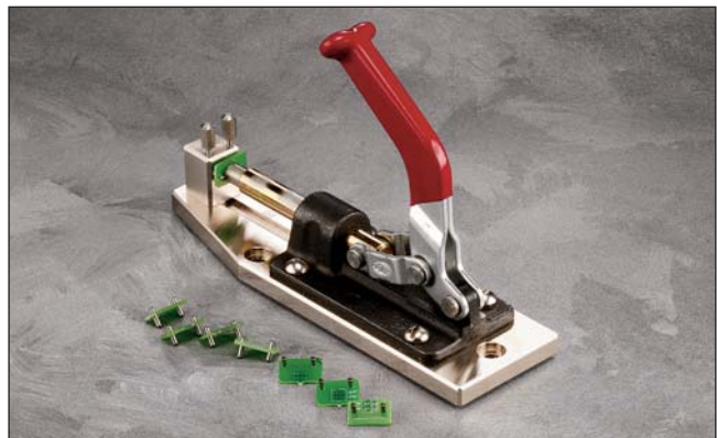
PWB Met Short Pin Loader (No. 60-5186) and mounted coupons.

20-3560 SamplKwick® Fast Cure Acrylic Kit