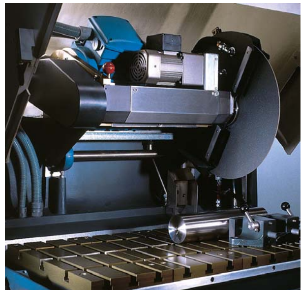
The DELTA features a spacious cutting chamber to accommodate large and irregular parts. Four large jets optimize cooling of the sample and wheel utilizing a full 6 gallon (22 liter per minute) flow rate. The cleaning system features a clean out hose and interior waterfall for easy end of day maintenance.