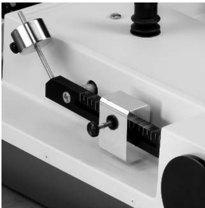
Weight arm and micrometer controls are conveniently located outside the cutting compartment.