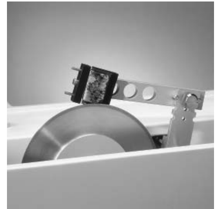
11-2484 Glass Slide Chuck holds petrographic samples for resectioning