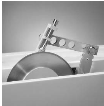
The 11-2482 Fastener Chuck makes longitudinal bolt sections easy.