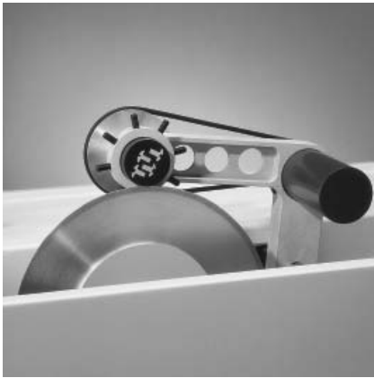
The 11-2181 Rotating/Oscillating Chuck Accessory is available for sectioning difficult materials.