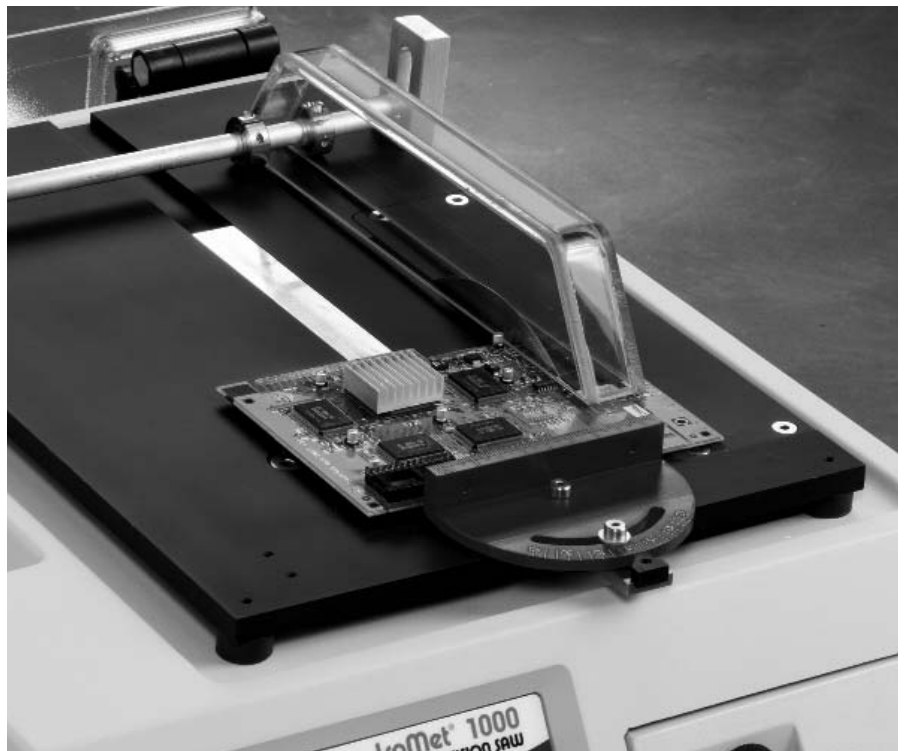
The 11-2182 Table Saw Attachment effectively sections or trims printed circuit boards or larger samples.