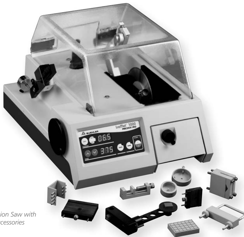
IsoMet® 1000 Precision Saw with optional fixturing accessories

The first step to quality sample preparation is selecting the proper cutting method, one that will not introduce structural damage or defects to the area under analysis. The IsoMet® 1000 Precision Saw was designed for today's material analyst who demands sample integrity and rapid sectioning capabilities. This saw quickly sections a broad range of materials including: