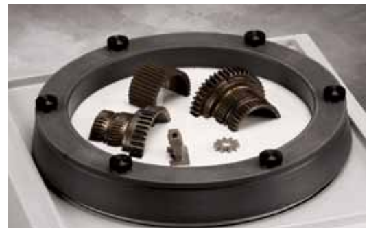
Large mounted specimens may be polished with ease. Once loaded, specimens require little operator attention.

For a complete listing of consumables, please refer to our Consumables Buyer's Guide. Buehler continuously makes product improvements; therefore, technical specifications are subject to change without notice.