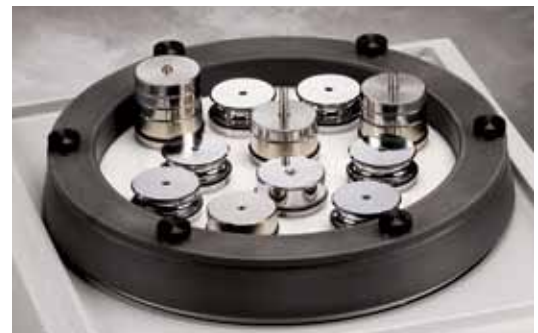
Generous specimen capacity allows up to 18 specimens to be prepared simultaneously.