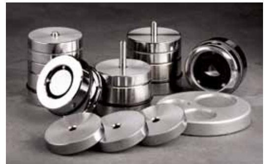
A variety of specimen holders and weights are available.