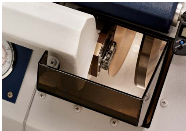
Glass slide mounted specimen is resectioned on the diamond cutting blade. The grinding wheel (right) reduces the specimen thickness without having to remove the specimen after resectioning.

The PetroThin® Thin Sectioning System is designed to accept most common petrographic slides: