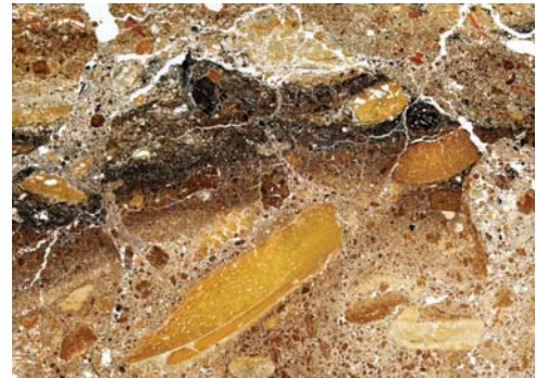
Microstructure from Niah Cave West Mouth, Sarawak, Malaysia which shows fine layers from the prehistoric cemetery sequence. The layers are primarily composed of guano. The slide was made by Julie A. Miller at the Thin Section Facility, Department of Archaeology, University of Cambridge, UK.

Diamond cutting and grinding wheels are mounted on one spindle so the glass slide need not be removed between steps. Both are precision aligned at the factory for easy, precise set-up. Two precision micrometers are used for controlling cutting and grinding. The resectioning micrometer is graduated to 0.01µm and can be locked at any desired setting to allow repetitive cutting to a pre-set thickness. The digital micrometer is graduated in inches/ microns and has a digital readout for accurate thin section grinding.