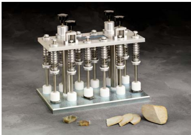
The 38-1490 PetroBond® Thin Section Bonding Fixture is designed to accurately control the thickness of the bonding media between the specimens and glass slides.