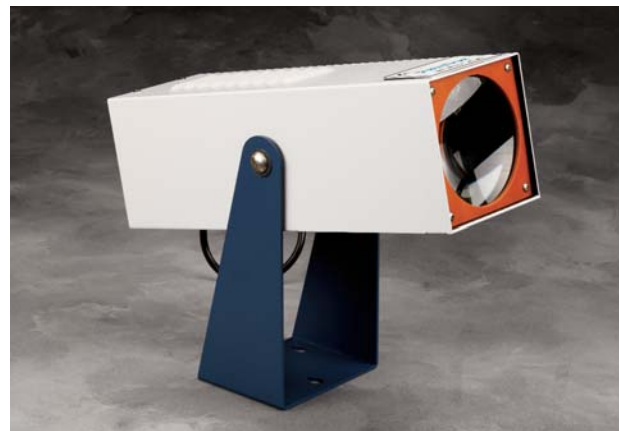
The 30-8050 PetroVue® Thin Section Viewer is designed for monitoring section thickness and uniformity during the grinding/lapping processes.