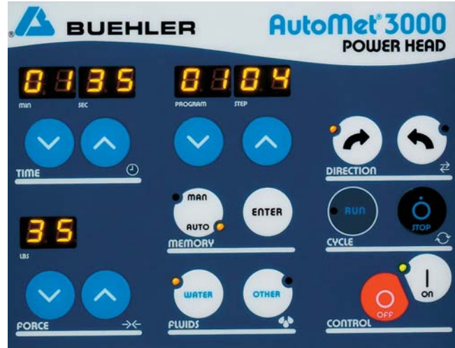
Programming the AutoMet® 3000 is made simple with the easy-to-read control panel.