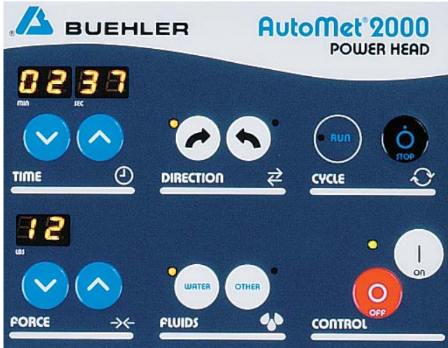
The front facia panel is easy-to-operate and allows control of AutoMet® 2000 functions.