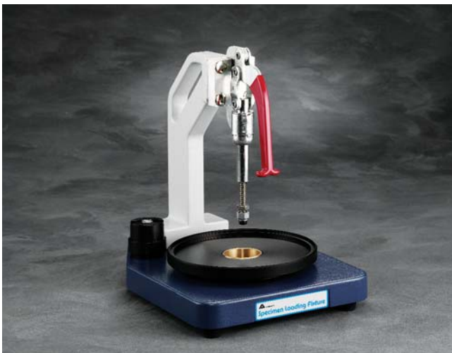
The 60-2410 Specimen Loading Fixture and 60-2413 Specimen Loading Plate level the specimens within the holder.