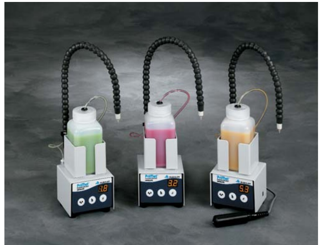
Programming the AutoMet® 3000 is made simple with the easy-to-read control panel.