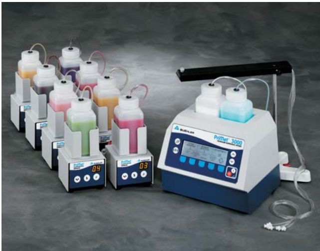
PriMet® 3000 Modular Dispensing System with PriMet® Modular Dispensing Satellites automatically dispense.