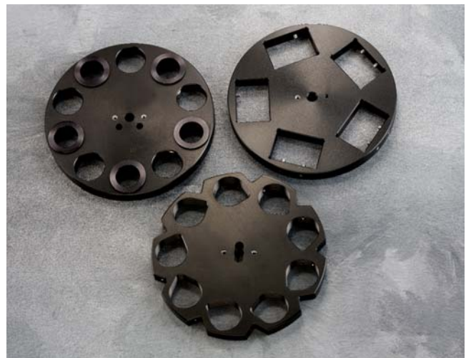
A variety of Specimen Holders are available for a multitude of sample sizes and shapes.