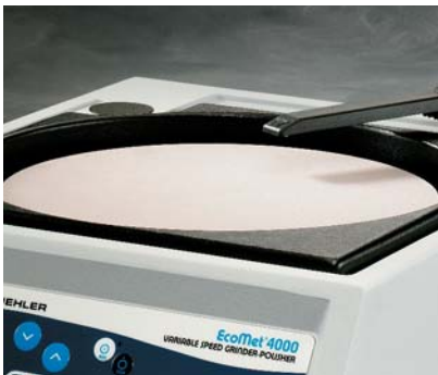
Pop-up water dispensing arm swings over any position on the platen.

The EcoMet® Grinder-Polishers feature a touch-pad front panel to control main power on/off, motor run on/off, platen variable rpm speed, and water dispensing on/off. Positive action tactile feed back buttons allow the operator to “feel” the control action. LED's indicate on/off status for main power, platen motor and water.