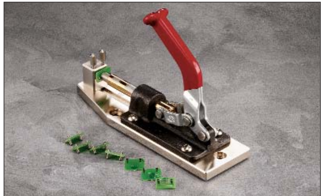
PWB Met Short Pin Loader (No. 60-5186) and mounted coupons.

20-3560 SamplKwick® Fast Cure Acrylic Kit