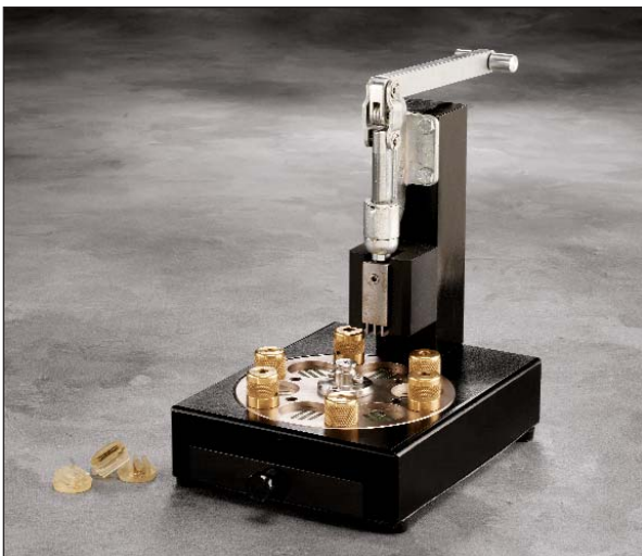
PWB Met™ Extractor (60-5185) removes polished samples from the PWB Met™ Small Hole Accessory.