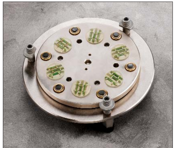
Mounted samples in the PWB Met™ Small Hole Accessory.