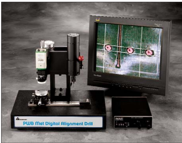
PWB Met™ Digital Alignment Drill aligns and drills holes for mounting pins.