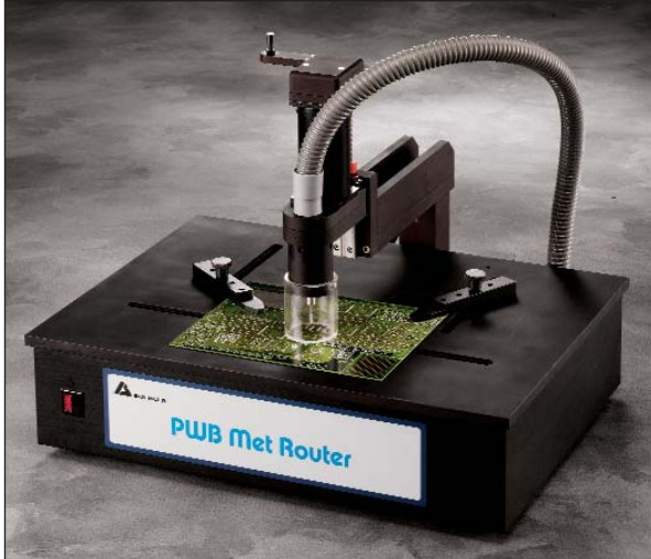
PWB Met™ Router routes out a coupon from a printed wiring board without damaging the plated through-hole.