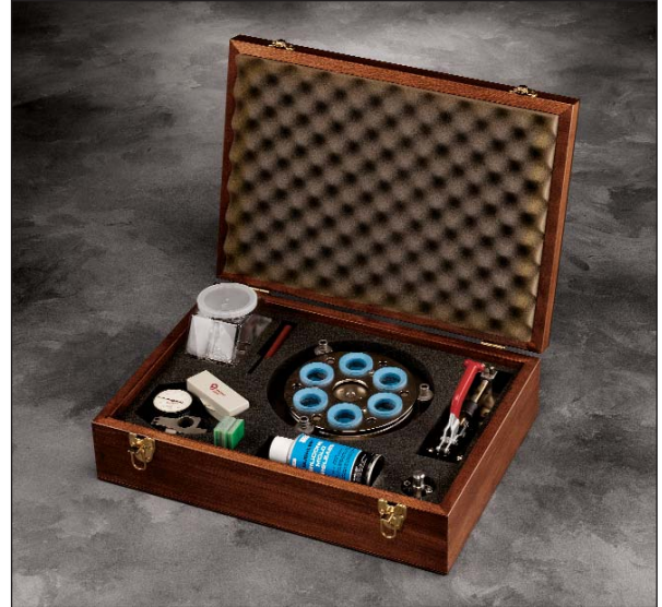
The precision components of the Nelson-Zimmer System are protected by a custom-made wood case.