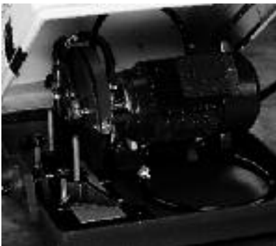
Delta® PetroCut™ Cutter showing Rock Clamp Assembly and Clean-out Hose.