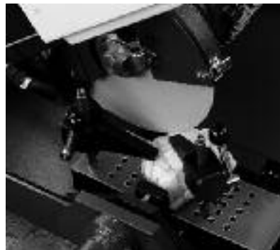
Rock Clamp Assembly with specimen.