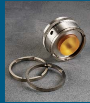
Bulk mount Target Holders come in a variety of sizes 60-8101 through 60-8105.