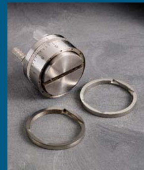
Target Holder for aligning features (i.e. Flip Clip Solder Balls) 60-8105