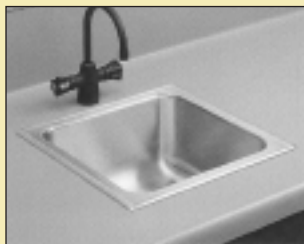
40-2120 Stainless steel sinks and faucets may be located as needed.

48-8493 Fascia Panel is designed to give a finished look to the exposed sides of Cabinet and Drawer modules mounted in the TechMet® tables