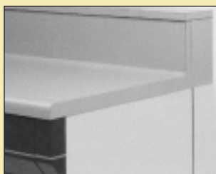
48-8320 TechMet® Reagent Shelf Kit is designed for use between the covered back panel of the TechMet® 1, 2, or 3 unit tables and the wall